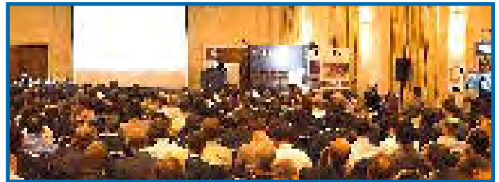
VCA Conference Europe